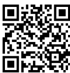
Ritsumeikan Journal of Asia Pacific Studies (RCAPS Journal)