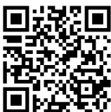
APU Journal of Language Research (APLJ)