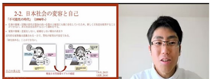
AP Conference Presentation by an APU undergraduate student at the Japanese/Undergraduate Session.

The APU Research Office would like to thank everyone for joining us at the 18th AP Conference and cordially invite one and all to join us at the next AP Conference. With a bit of something for everyone, you are sure to find something of interest to you! The official AP Conference homepage, which can be accessed here or using the QR code to the right, not only contains a wealth of information and pictures of the 18th AP Conference, but also provides regular updates for the next conference. Be sure to check it out!