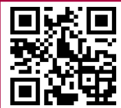
QR Code: AP Conference Official Homepage

The APU Research Office would like to thank everyone for joining us at the 18th AP Conference and cordially invite one and all to join us at the next AP Conference. With a bit of something for everyone, you are sure to find something of interest to you! The official AP Conference homepage, which can be accessed here or using the QR code to the right, not only contains a wealth of information and pictures of the 18th AP Conference, but also provides regular updates for the next conference. Be sure to check it out!