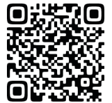
Faculty Database Profile

This research project is a comparative study on sustainable community development in depopulated areas that aim to revitalize their communities through tourism during the COVID-19 pandemic era. The study considers the following countries: Japan, South Korea, the United Kingdom, Germany, Italy, and New Zealand. The socio-economic impact of COVID-19, as well as general perceptions regarding community revitalization via tourism, will be revealed. Additionally, the process of community regeneration from the COVID-19 pandemic will be investigated, and a sustainable community model based on post-COVID-19 tourism shall be presented.