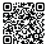
Faculty Database Profile

For the purposes of this research project, map illustrations on Red Seal Trade Ships (Shuinsen) and Japanese Quarters featured in History textbooks used in Japanese junior high schools and senior high schools since the 1980s will be collected and examined. In addition to the aforementioned contents, the process from creation to publication and distribution of said illustrations will be elucidated. The context of these map illustrations will be considered in relation to academic trends, academic theories and the social circumstances surrounding textbook publication.