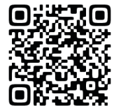
Faculty Database Profile

Taking into account Porter's hypothesis that environmental regulations encourage and induce innovation, this research project seeks to first analyze the mechanisms and appropriateness of automotive environmental policy decisions in the European Union (EU), which has the strictest automotive environmental regulations in the world. Secondly, the project will elucidate corporate strategies adopted by European and Japanese automakers to keep in line with the environmental regulations. Furthermore, the impact of environmental regulations on the automotive industry as a whole (including supply chains) will be analyzed from the viewpoint of Global Value Chains. Lastly, new movements in the electrification of vehicles shall be examined.