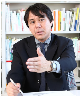
Professor KUBO Takayuki

Taking into account an increasing number of international students at universities in Japan, the implementation of active learning, the introduction of academic courses taught in English at Japanese universities and the adoption of new appropriate and effective teaching methods must be examined. This research project aims to examine what types of teaching methods are effective in promoting self-initiated, interactive and deep learning in students, and to develop and propose such methods. To achieve that, the following research questions will be explored in relation to university classes taught in English: (1) How and when is translanguaging used? (2) The role of translanguaging in co-constructing knowledge and establishing effective communication between classmates during in-class discussions and activities. (3) The usefulness of translanguaging in the process of meaning-making.