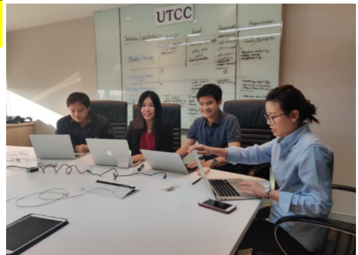
First official research meeting at UTCC (Bangkok, Thailand)