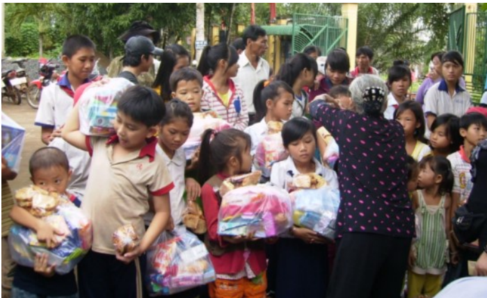
A Buddhist practitioner distributing gifts to rural kids at a school in a Southern Vietnam province.

The context of this research is Vietnamese population's rapid ageing due to lower birth-rate and longer life expectancy. Vietnamese elderly (defined as those above 60 years old by the Vietnamese government) accounts for more than 10 percent of its population in 2017. By exploring Vietnamese elderly's Buddhist social practice, this research hopes to gain insight into the experience of being old in Vietnam's rapidly changing society.