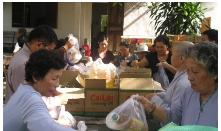
Buddhist practitioners sorting out gifts for people with leprosy in a lepers' village in a Southern Vietnam province.

To collect data for this research, I have conducted field research among charity givers and organizers in southern Vietnam. I have joined my informants in their charity events in hospitals, lepers' colonies and rural villages inside and outside of Ho Chi Minh City. I have participated in the various stages of my informants' charitable activities, from planning, fund raising, contacting local authorities and recipients and travelling to rural villages. Although the research is still ongoing, the field data I have collected so far highlights the connection between charitable activities and senior-aged charity-givers' sense of self-worth, social belonging and status.