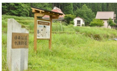
Hita Oukan Nakatsu Historical Street