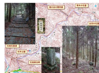
Map and pictures of Hita, Oita Prefecture