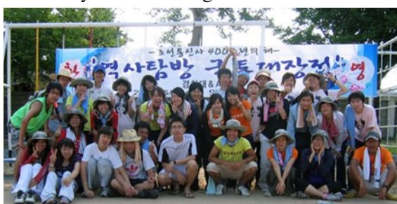
Field study program with Korea University