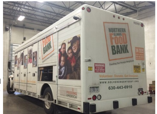
Northern Illinois Food Bank truck delivering donated food

My research has been largely focused on the establishment of accounting standards for non-profit organizations (hereafter ‘NPOs’). At the preliminary stages of my research, I investigated the different types of non-profit accounting standards that exist in each country and did research on how to evaluate the effectiveness of non-monetary donations. The outcomes and results of my research are summarized in academic papers and books. For instance, I wrote a book chapter in “Food Banks: Support for the Hungry Around the World and Japan and Countermeasures Against Food Waste” (published by Akashi Shoten ). My book chapter focuses on the accountability of American food banks. In it, I evaluate both the current state of the Japanese food bank system, the American NPOs and food banks, as well as their system for feeding the hungry. I have also contributed to the “Practical Handbook for Tax Accountants/Certified Public Accountants of NPOs” (published by Seibunsha ).