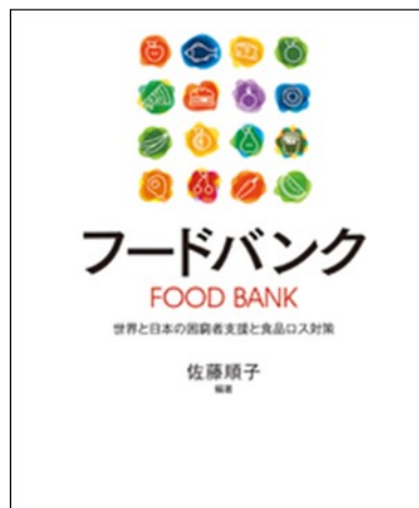
Book cover of “Food Banks: Support for the Hungry Around the World and Japan and Countermeasures Against Food Waste”