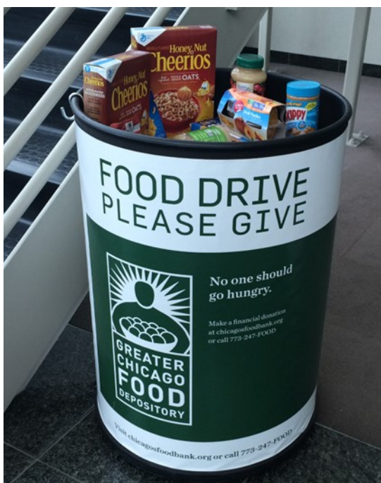
Greater Chicago Food Depository food donation bin