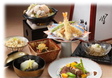
Halal Japanese Kaiseki