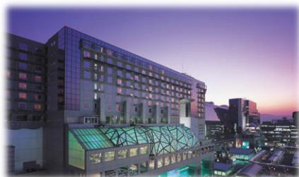
Hotel Granvia Kyoto