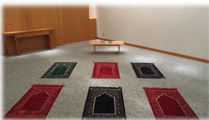
Prayer room setting